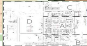
View of Main Dormitories B004A in Site 009 under construction extracted from the progress report of March 2016