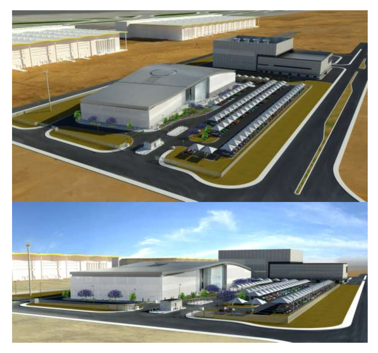
Visualizations of NDIA Backup Approach & Training Center

Final design of the building was performed by Ghafari Associates LLC and "Kanon Consulting" was commissioned to perform the structural design review and the production of the concrete shop drawings.