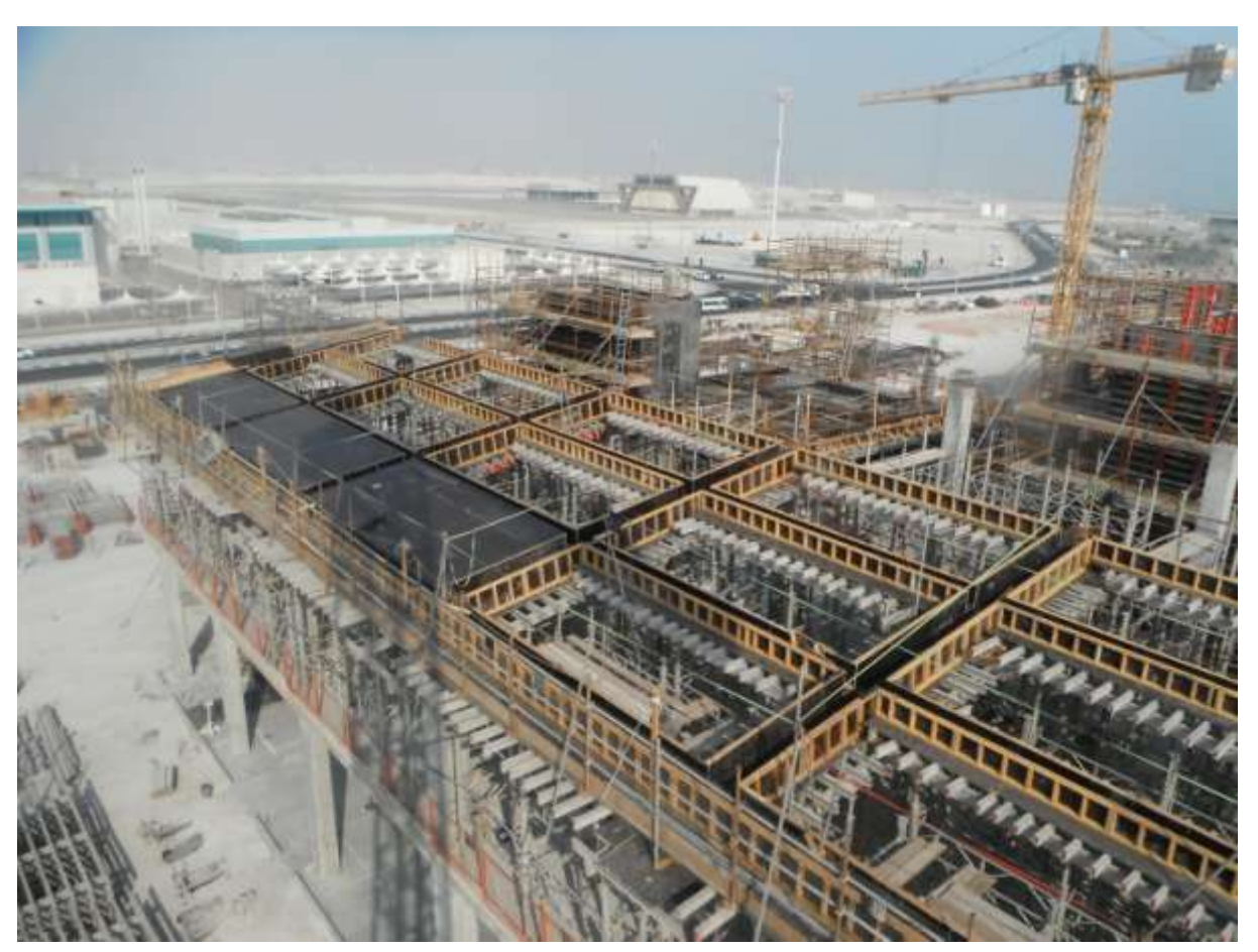
View of the Backup Approach & Training Center Building during installation of roof formwork